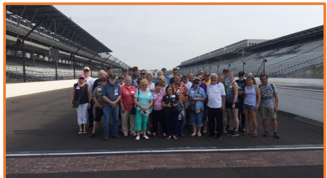
The Midwest Region at the Yard of Bricks!

President's Message Indy Meet Report Business Meeting Region Historian In Memoriam Welcome and Updates Photo Collage