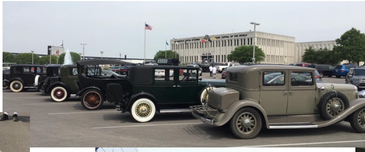
Indianapolis Motor Speedway