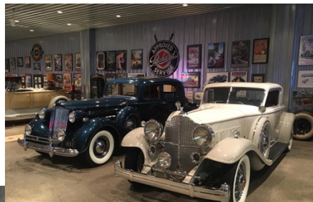
The Gerber Collection