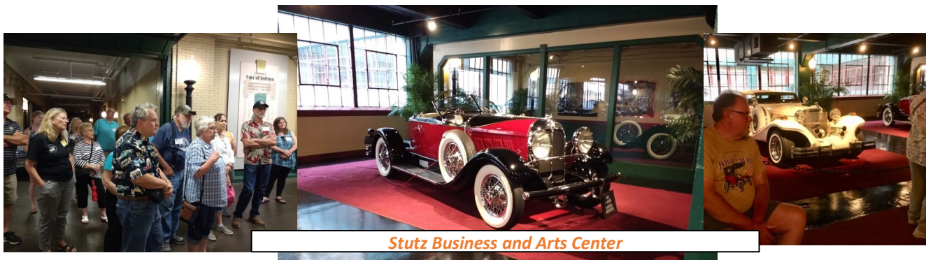
Stutz Business and Arts Center