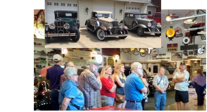
The Goodwin Collection