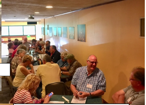
Johnny V's Mainstreet Grill