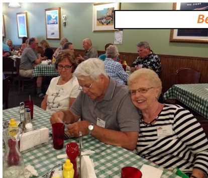
Bearcats Bar and Grille