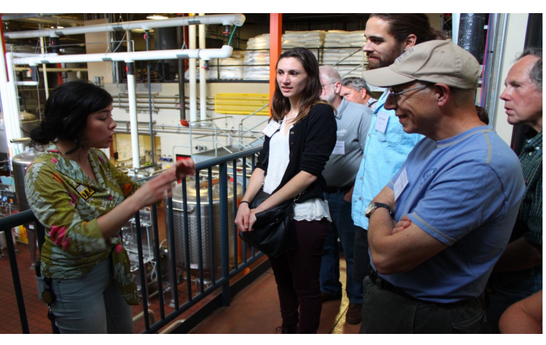
Bell's Cornstock Brewery