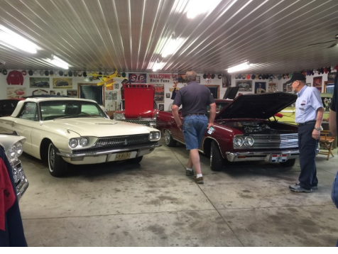
Deming Collection - Dean Dorholt