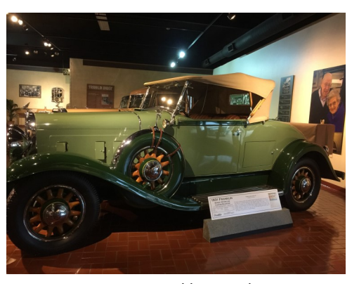
1931 Series Franklin at Gilmore