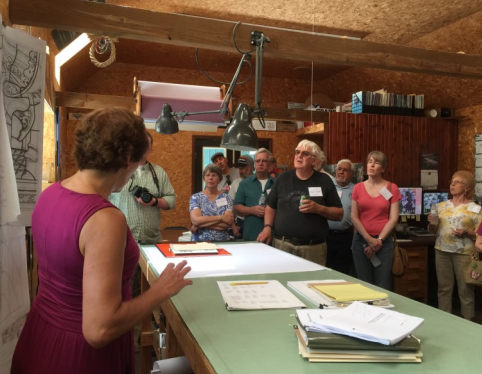
Full Spectrum Stained Glass