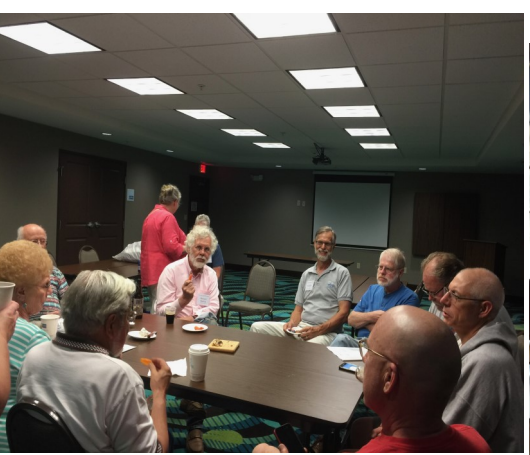
Hospitality Room at Holiday Inn Express