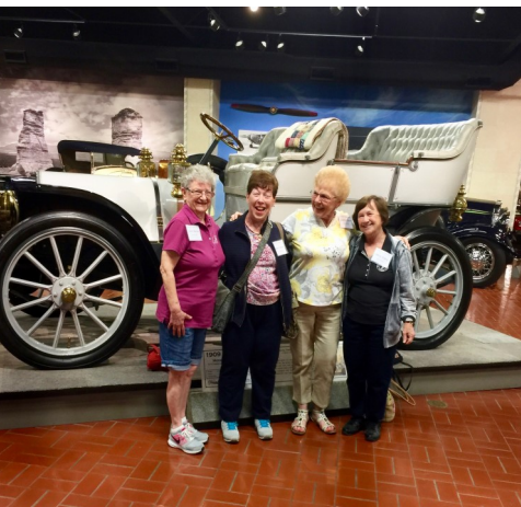
"Fab (Midwest) Franklin Four"